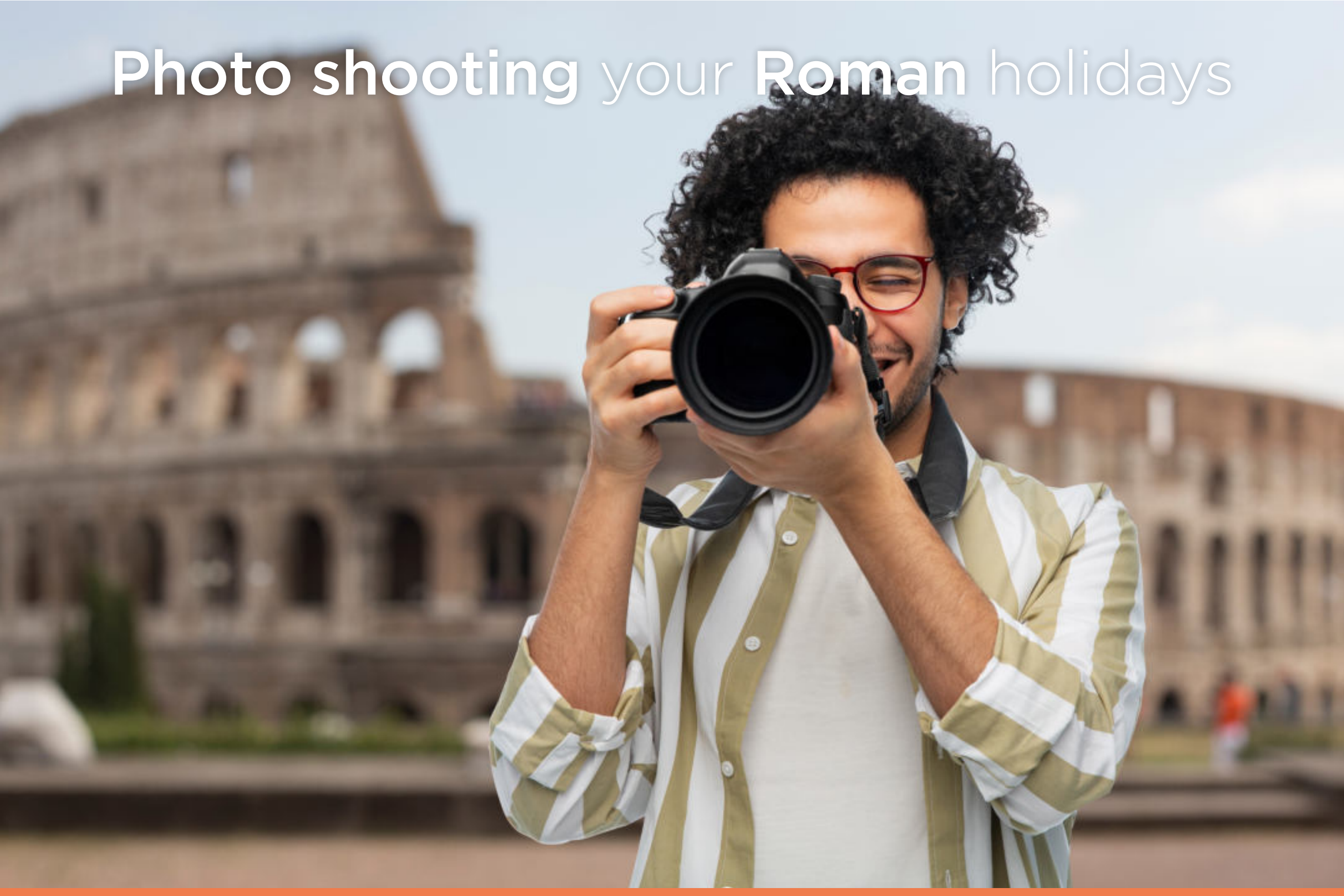
Photo shooting your Roman holidays